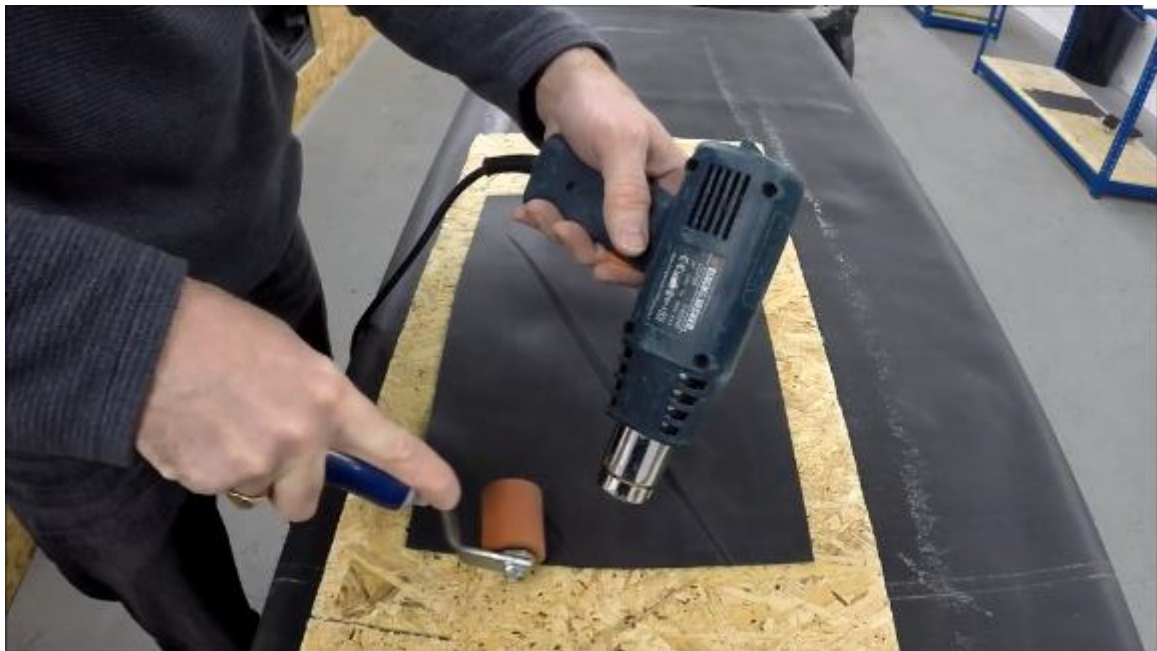
Fig 3: Working quickly and evenly across the membrane.

Work quickly and efficiently across the creased area without remaining in one place for too long.